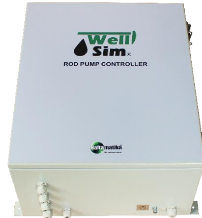
Fig. 1 WellSim Marathon B